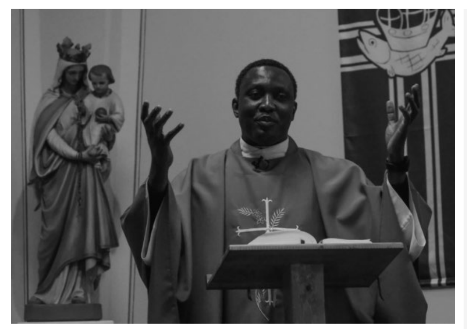
This picture was taken by Maria, a visiting photographer. It is very appropriate for our Mother's Day issue!