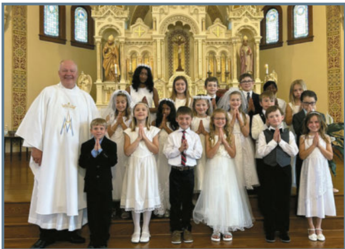
Sunday, May 7