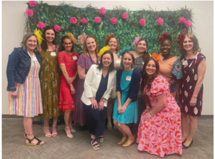
Mary Queen of Peace School Staff