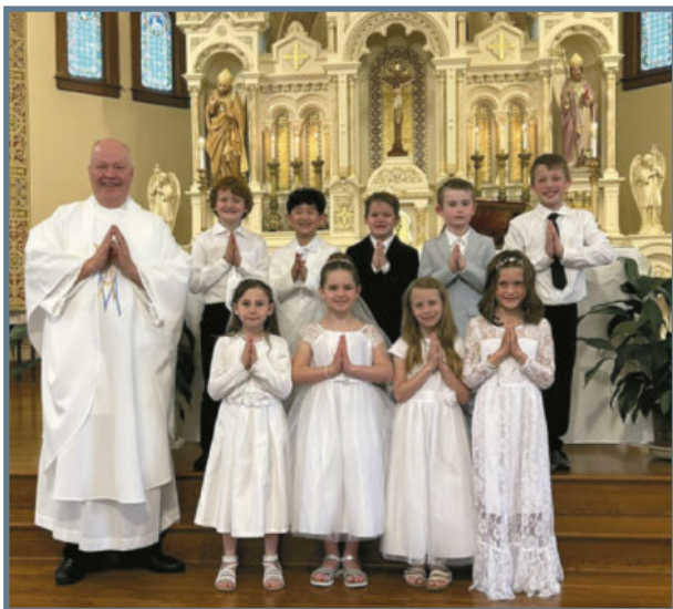
Saturday, May 6