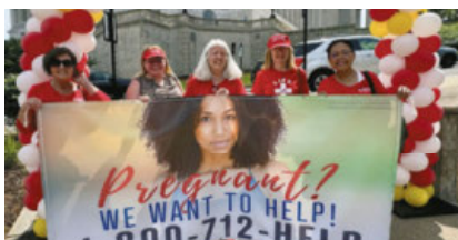
MidWest March for Life