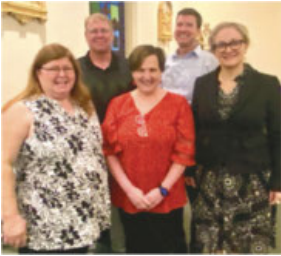
Our Music Ministry Team deepens the reverence of our liturgies.