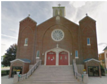
ST ANTHONY OF PADUA CHURCH 111 School St. Bristol, CT 06010