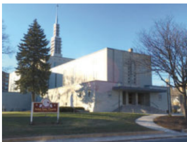
ST. ANN CHURCH 215 West St. • Bristol, CT 06010