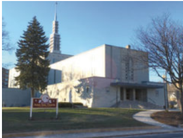
ST. ANN CHURCH 215 West St. • Bristol, CT 06010