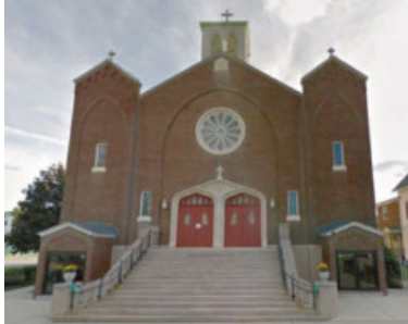
ST ANTHONY OF PADUA CHURCH 111 School St. Bristol, CT 06010