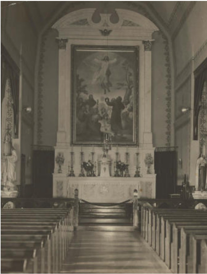
Inside of Ascension before the fire of 1977