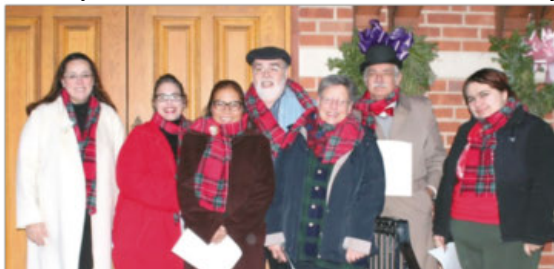
Members of the Theatre Guild of Berlin