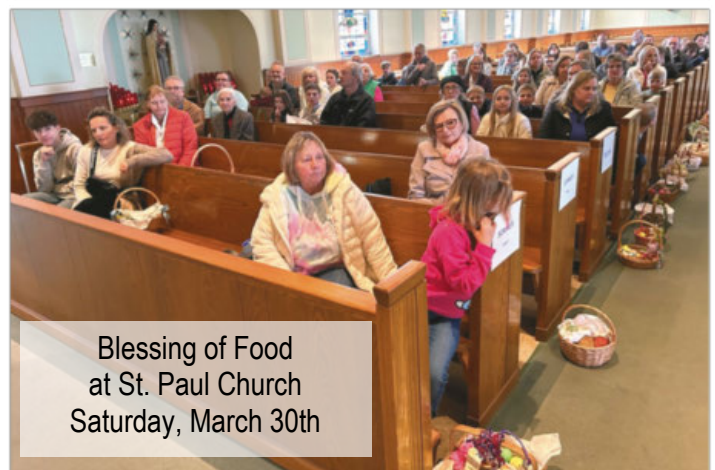
Blessing of Food at St. Paul Church Saturday, March 30th