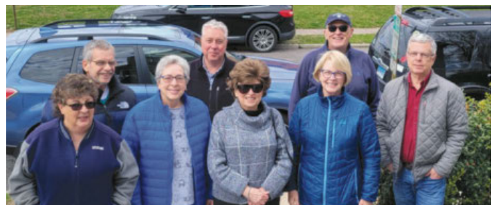
Thanks to everyone on our delivery team!