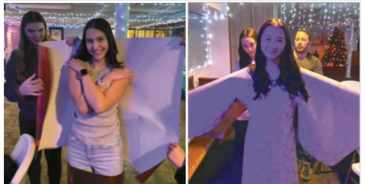
Photos are from our Life Teen Advent Christmas Party on 12/1.