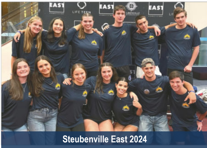
Steubenville East 2024