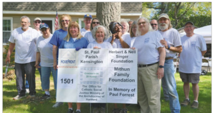
Members of the St. Paul Parish 2025 HomeFront Team