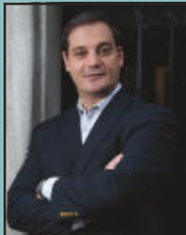
Proud to support Church of the Holy Family