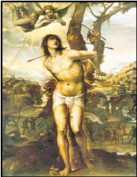
Saint Sebastian Pray For Us

saintsebastianmiddletownct.weebly.com to download the membership form, fill in and email or drop in collection basket.