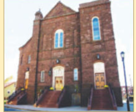
ST. PATRICK 64 Pearl Street

Visit us on the web Website Straymondenfield.org