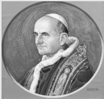
St. Paul VI