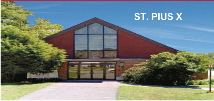
ST. PIUS X

St. Joseph-St. Pius X Parish Office Mother St. John House 761 Main Street, Leicester, MA 01524