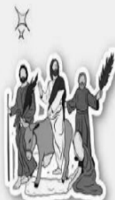
PALM SUNDAY April 13