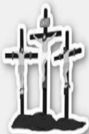
GOOD FRIDAY OF THE LORD'S PASSION April 18