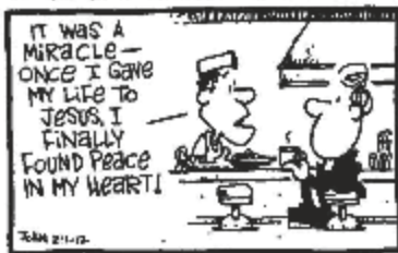
2 nd SUNDAY IN ORDINARY TIME