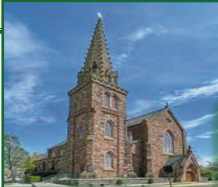
Corner of Spring St & Memorial Blvd. W. Newport, RI