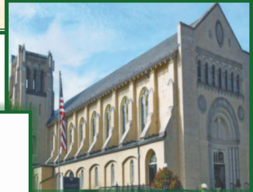
Corner of Carroll Ave. & Harrison Ave., Newport, RI