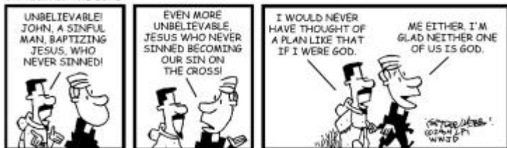
BAPTISM OF THE LORD

The survey can be taken online via the parish website or by completing a paper copy of the survey from the supply in the vestibule. All responses are anonymous. Completed copies of the survey may be returned to the collection box in the vestibule or mailed to the Parish Office. The survey closes Sunday, January 16 .