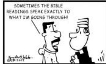
3RD SUNDAY IN ORDINARY TIME

We've heard the phrase "Don't sell yourself short." Social media aside, many of us tend to focus on our shortcomings: We may wish we could run faster, be better at our jobs, have a cleaner home, in general, "get it together!" Truth is, we're all works in progress. That's what I love about Paul's Letter to the Corinthians. He reminds us that each one of us - whatever our strengths or weaknesses - is part of the body of Christ. God loves us with our imperfections, not in spite of them. As such, each of us has indispensable value and much to contribute to the mission of the Church. As we move into the week ahead, today's readings invite us to place ourselves at the service of the Church and one another. Beyond that, we can invite others to join us by recognizing that God values the talents - and foibles - that each of us brings to his service.