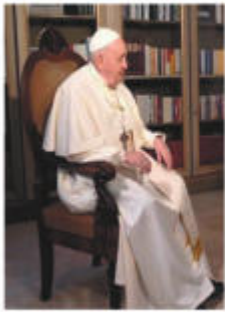
Pope Francis speaks to a reporter

"I believe that morally everyone must take the vaccine," the pontiff said in an interview for Italy's TG5 news program. "It is the moral choice because it is about your life but also the lives of others."