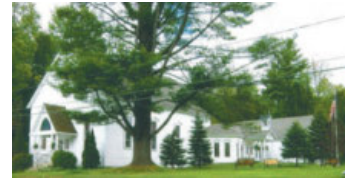
St. Paul's 771 Route 29, Rock City Falls

PO Box 547 Greenfield Center, NY 12833 518-893-7680 StJosephStPaul@gmail.com StJosephsChurchGreenfieldCenter.org