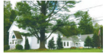
St. Paul's 771 Route 29, Rock City Falls

PO Box 547 Greenfield Center, NY 12833 518-893-7680 StJosephStPaul@gmail.com Website: StJosephsChurchGreenfieldCenter.org