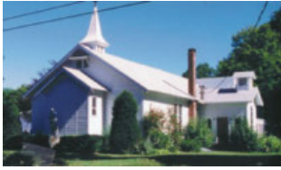
St. Joseph's 3159 Route 9N, Greenfield Center