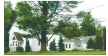
St. Paul's 771 Route 29, Rock City Falls

PO Box 547 Greenfield Center, NY 12833 518-893-7680 StJosephStPaul@gmail.com Website: StJosephsChurchGreenfieldCenter.org