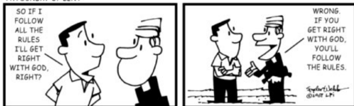
4TH SUNDAY OF LENT

Over the forty years that the Israelites journeyed through the desert, God provided them with manna to eat. As soon as they were able to enjoy the fruits of the Promised Land the manna ceased. Likewise, God's blessings to us may change over the years but it is important to trust that God will always provide us with all that we need.