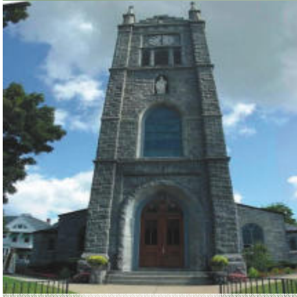
St. Patrick ~ Monson, MA [1878] A National Catholic Historic Site [1999]