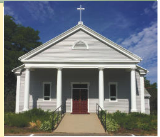
St. Christopher ~ Brimfield, MA [1953]