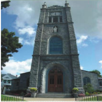
St. Patrick ~ Monson, MA [1878] A National Catholic Historic Site [1999]