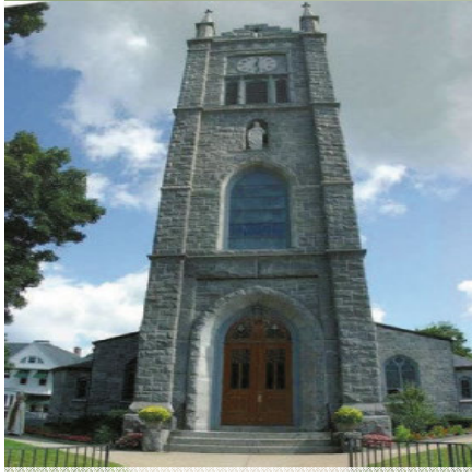
St. Patrick ~ Monson, MA [1878] A National Catholic Historic Site [1999]