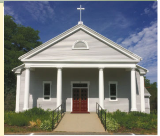
St. Christopher ~ Brimfield, MA [1953]