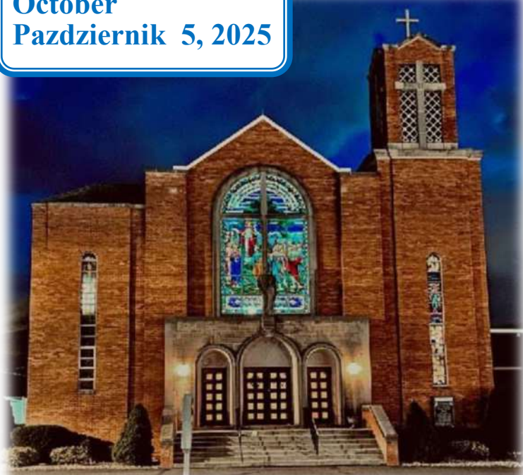
Picture: St. Joseph Church in Vernon Rockville, CT