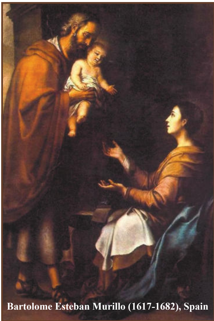
Bartolome Esteban Murillo (1617-1682), Spain