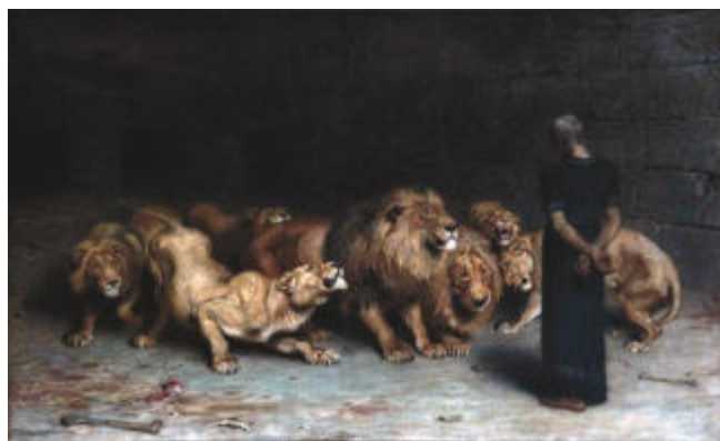
DANIEL IN THE LIONS DEN by Briton Rivière (d. 1920)

But the one who perseveres to the end will be saved. —Mt 24:13