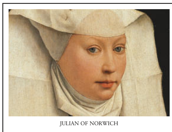
JULIAN OF NORWICH

The first excerpt below is from Pope Benedict XVI's General Audience of 1 Dec 2010. The second is from Julian of Norwich's (d. 1430) Revelations of Divine Love . Julian's account of her visions was the first book written by a woman to be published in England.