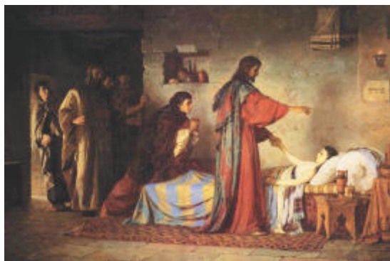
RESURRECTION OF JAIRUS' DAUGHTER by Vasily Polenov (d. 1927)

The first excerpt below is from St Catherine of Siena's (d. 1380) dialogue On Divine Providence . The second is from St Augustine's (d. 430) autobiography entitled Confessions . Faith is necessary for salvation, and it is a gift of God. As St Augustine says, "You called, you shouted, and you broke through my deafness; you flashed, you shone, and you dispelled my blindness." God's purpose and faith's goal? As St Catherine said: "I tasted and I saw ... you could give me no greater gift than the gift of yourself."