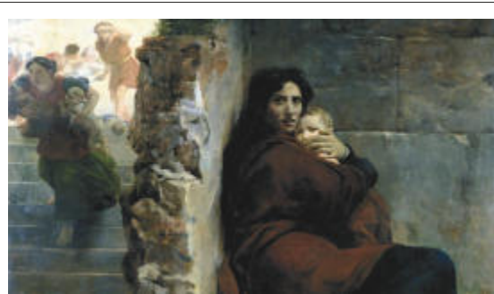
MASSACRE OF THE INNOCENTS [detail] by Léon Cogniet (d. 1880)

The following excerpt is from Pope St John Paul II's (d. 2005) homily of 7 May 2000 (3rd Sunday of Easter). The Holy Father spoke of the vast number of Christians who've suffered/died for the faith—"the witness to Christ borne even to the shedding of blood has become a common inheritance of Catholics, Orthodox, Anglicans and Protestants"—in the last century alone.