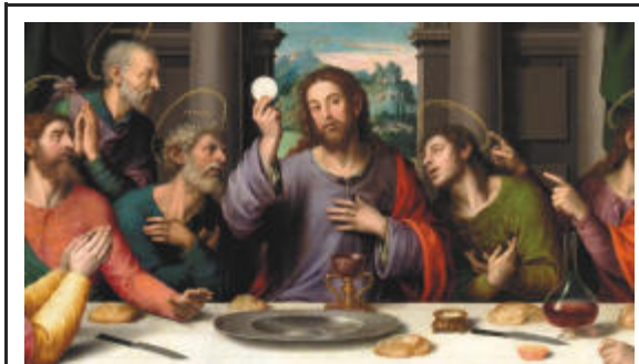
THE LAST SUPPER [detail] by Juan de Juanes (d. 1579)

The second excerpt, by way of example, is from the life of St John Vianney (d. 1859).