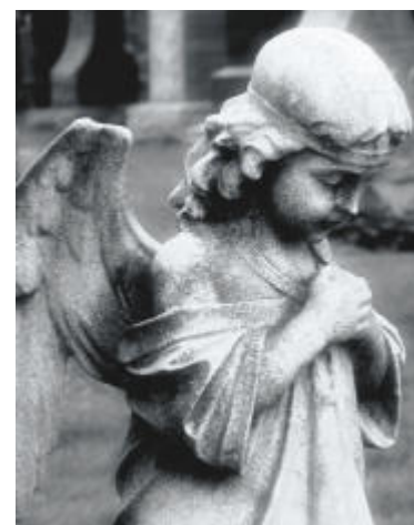
PRAYER FOR THE HOLY SOULS IN PURGATORY

published: her Life [entitled Dialogues of the Soul and the Body ] and the Treatise on Purgatory . When the cause for her beatification/canonization was proposed, the Holy See cited these two works as sufficient proof of her sanctity.