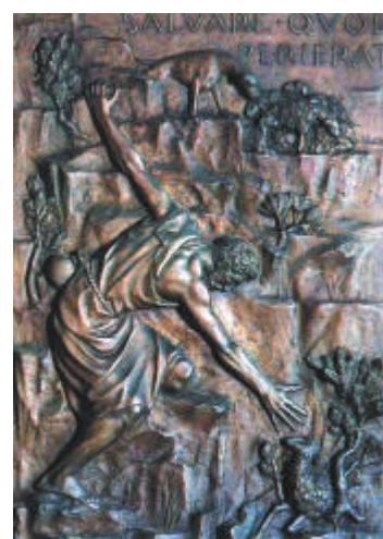
LOST SHEEP — HOLY DOOR PANEL St Peter's Basilica, Vatican City

The first excerpt below is St Bernard of Clairvaux's description of the Stages of Sin. The second is from St Cyril of Jerusalem's (d. 386) Catechetical Instructions . The third, from a sermon by St Augustine (d. 430). Sin is the one thing we must truly fear, but easy to cure by the one acceptable sacrifice we offer God: a humble/contrite heart. We're urged to repent at the time of God's favor (i.e., now!). In the words of St Paul: "Behold, now is a very acceptable time; behold, now is the day of salvation" (2 Cor 6:2).