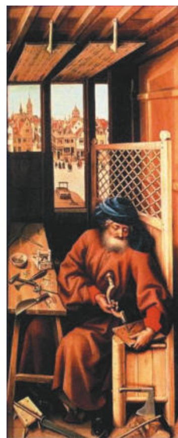
SAINT JOSEPH THE WORKER by Robert Campin (d. 1444)

Due to the increasing severity of his illnesses, St Francis of Assisi (d. 1226) was urged to codify the Rule of his order and submit it for papal approval. Francis complied and submitted a Rule in 1221. Though it was not approved on account of its rambling style, it clearly reflected the Saint's thought/ spirituality and the manner of life in the early years (1210-1221) of the Franciscan Order. A revised and simplified Rule was approved in 1223. The first excerpt below is taken from St Francis' first Rule : Chapter VII, "On the Manner of Serving and Working". The second excerpt, by way of example, is from the life of Brother Giles (d. 1262), foremost amongst the first followers of St Francis.