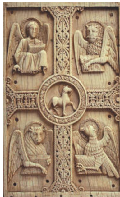
BOOK OF THE GOSPELS

The first listing of the 27 books of the NT dates to St Athanasius' (d. 373) Easter Homily in 367. By the fourth century, there was unanimity in the West concerning the canon as it is today. Before St Ireneus (d. 202)—regarded as the first great Catholic theologian—, Christian communities differed on the gospel(s) they accepted/preferred and whether the gospels should be harmonized (i.e., edited/combined into a single