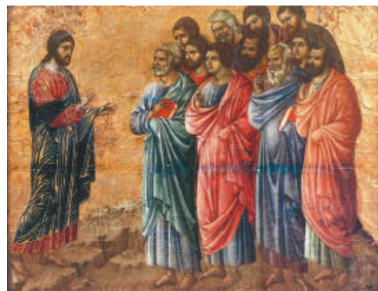
THE GREAT COMMISSION by Duccio di Buoninsegna (d. 1319)

In his Commonitorium (ca. 434), St Vincent of Lerins (d. 445) explains the general rule whereby we distinguish Catholic truth from heresy. St Vincent was described by others as a man "preeminent in eloquence and learning". The rule, in brief, is the authority of Holy Scripture. Unfortunately, men differ in its interpretation. And the rule, in consequence, must be supplemented by an appeal to the sense of Holy Scripture which is supported by universality, antiquity, and consent. By universality , when it is the faith of the whole Church; by antiquity , when it is that which has been held from the earliest times; and by consent , when it has been the acknowledged belief of all, or almost all, whose office/character gave authority to their determinations.