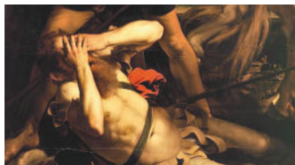
CONVERSION OF SAINT PAUL [detail] by Caravaggio (d. 1610)