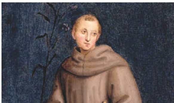
SAINT ANTHONY OF PADUA [detail] by Raphael (d. 1520)

While we have numerous outlines of homilies delivered by St Anthony of Padua (d. 1231), we have only one sermon recorded as it was actually delivered by the Saint. The exact date/occasion is uncertain, but we do know it was addressed to the monks of the Abbey of St Martin [Limoges, France] ca. 1226. It is a reflection on the beauty of the monastic vocation, a call by God to leave the world and to live entirely for Him. Scripture references added.