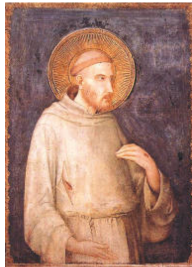
SAINT FRANCIS OF ASSISI by Simone Martini (d. 1344)

In the words of St Robert Bellarmine (d. 1621), "the school of Christ is the school of charity". The Catechism (#1825) teaches: "The Lord asks us to love as he does, even our enemies, to make ourselves the neighbor of those farthest away, and to love children and the poor as Christ himself." Faith compels us to do this, and only faith makes it possible. By way of example, the first excerpt below is from an early Life of St Francis of Assisi (d. 1226). The second is from St Don Bosco's (d. 1888) autobiography Memoirs of the Oratory .