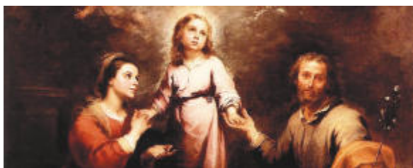
THE HOLY FAMILY [detail] by Bartolome Esteban Murillo (d. 1682)

The excerpts below are from the first homily of Pope Francis' pontificate. His topic was the role of St Joseph, custos [Lt., keeper/custodian/guard] and protector of the redeemer. Elected as the bishop of Rome and successor St Peter on 13 Mar 2013, Pope Francis chose to be installed on 19 Mar 2013, the Solemnity of St Joseph. Pope St John Paul II's apostolic exhortation Redemptoris Custos [Guardian of the Redeemer, 15 Aug 1989] speaks of the role of St Joseph at greater length.