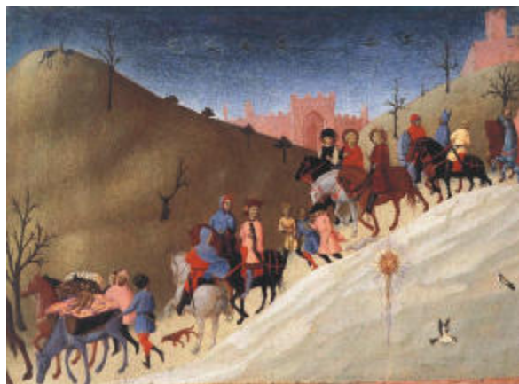
JOURNEY OF THE MAGI by Stefano di Giovanni (d. 1450)

The following is an excerpt from Pope Benedict XVI's homily on the Feast of Epiphany (6 Jan 2006), the first full year of his pontificate. Italics added.