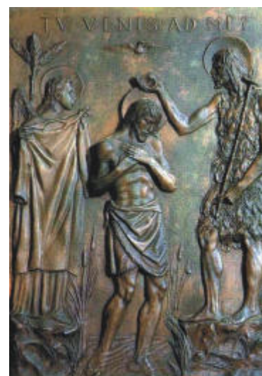
BAPTISM OF THE LORD Holy Door Panel, St Peter's Basilica

matter of course that the baptized should include "infants and small children" as well as adolescents, young adults and older people. The oldest known ritual, describing at the start of the third century the Apostolic Tradition , contains the following rule: "First baptize the children. Those of them who can speak for themselves should do so. The parents or someone of their family should speak for the others." At a Synod of African Bishops, St Cyprian stated that "God's mercy and grace should not be refused to anyone born," and the Synod, recalling that "all human beings" are "equal," whatever be "their size or