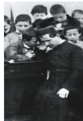
SAINT JOHN BOSCO

He sent us a formal invitation. Despite my refusal, he sent us whatever we would need to make an honorable appearance with the rest. A spot was reserved for us in piazza Vittorio, amongst all the organizations of whatever name, purpose, and condition. What was I to do? To refuse was to declare myself an enemy of Italy. To acquiesce would mean accepting principles which I judged would have disastrous results.