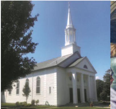
St. Patrick's Parish